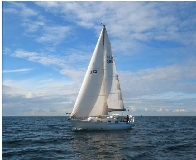
Boomaroo nears the finish.

Over the line and on handicap it was Sundance, Boomaroo and Tiercel.