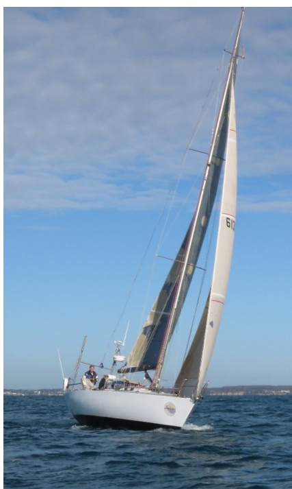
Sundance overhauls Tiercel.

A staggered start, and all away OK but soon Boomaroo suffered a torn jib