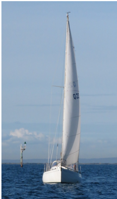
Boomaroo has Tiercel in her sights as wind drops (W#3 in background).

and had to change to no. 2. Despite this, she overtook Tiercel during the last leg, Sundance by then having overtaken both. Boomaroo and Tiercel both suffered from dying wind in the last few minutes, after Sundance was safely home.