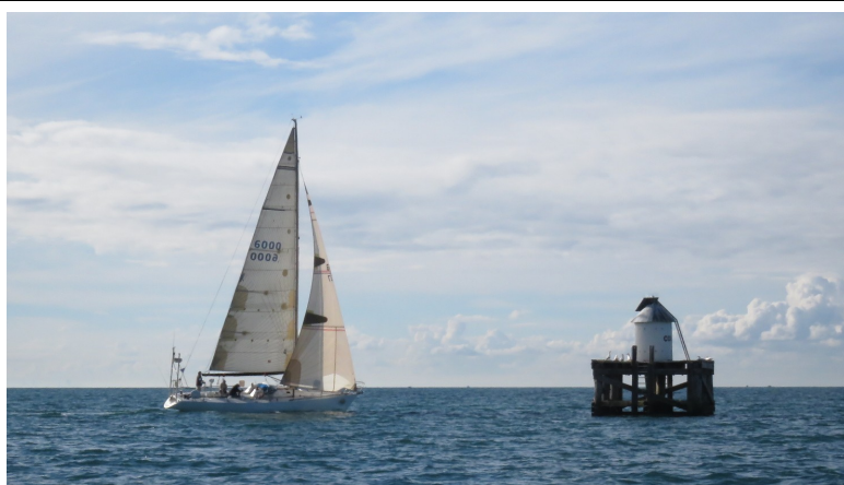
Sundance approaching Coles Light.

Tiercel. In the light northerly wind, the course was: QA, Swan Spit (P), Coles Light, West #4, West #3, Coles Light, W#4, W#3, QA, all to Sbd except Swan Spit.