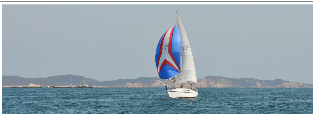
Valentine, the Annulus and Mornington Peninsula.