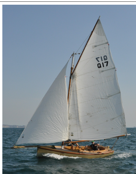
Warrior with some breeze at last.

winds at 14.25 similarly Div 3 at 14.35.