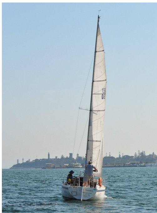
Valentine and Queenscliff.