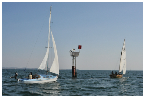
Tintagel and Warrior round the mark (carefully)..

For the rest of the race, until shortened at Swan Spit, there was plenty of close interaction around marks but without grief, involving at least Tintagel, Warrior and Tiercel. On the leg between W#3 and QA Tiercel was catching up in the slipstream of Valentine until changing course to reduce anxiety. This resulted in losing ground again. In the latter stages of