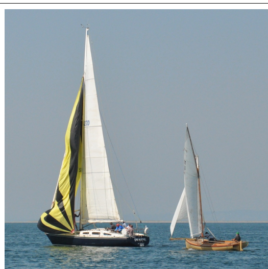
Who's going faster now?