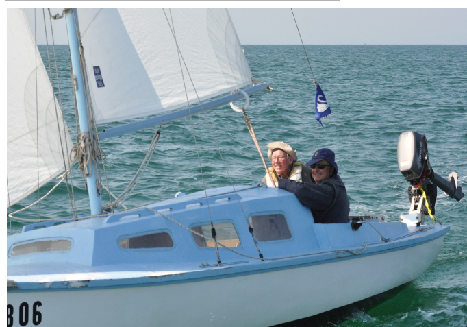
Tintagel fighting it out near the finish.

For the rest of the race, until shortened at Swan Spit, there was plenty of close interaction around marks but without grief, involving at least Tintagel, Warrior and Tiercel. On the leg between W#3 and QA Tiercel was catching up in the slipstream of Valentine until changing course to reduce anxiety. This resulted in losing ground again. In the latter stages of