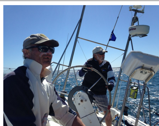
Concentration on Sundance