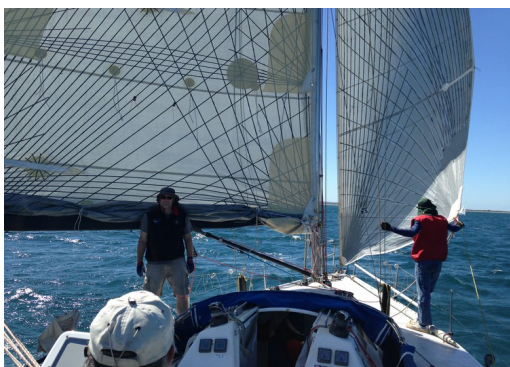
Hold them sails