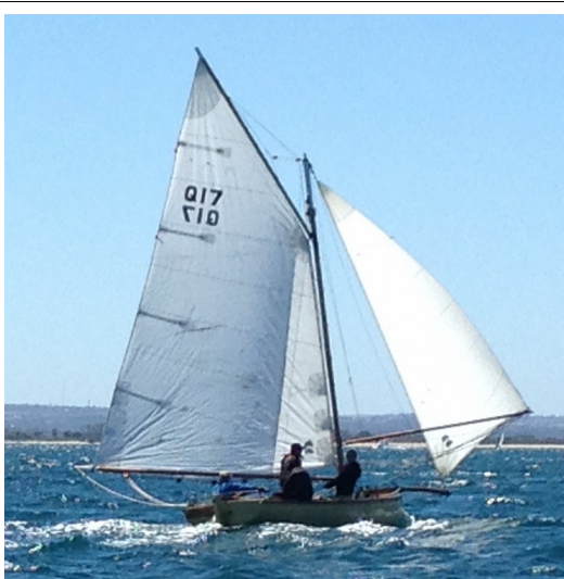
Warrior powering down-wind