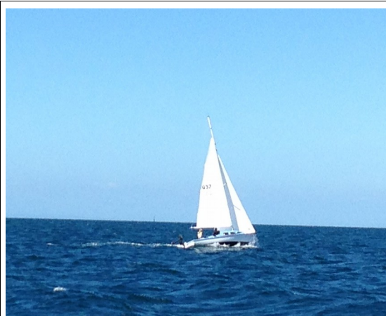
Tintagel reefed down