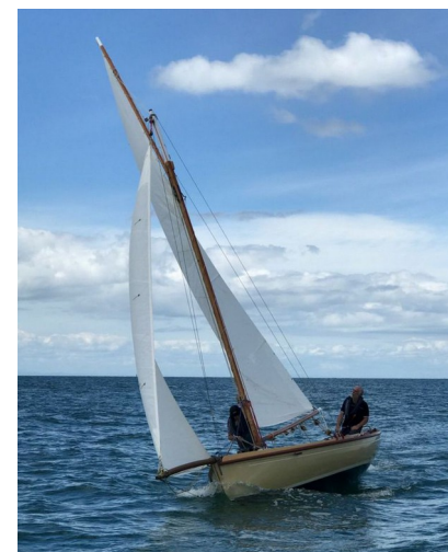
Warrior on a better day.

the timing of the increase was looking worse as the day approached. In the end a good decision to cancel as the wind got up rapidly to well over the forecast, and into the region of 27 knots (lower 20's recorded even in the harbour where Tiercel was reinstating her anemometer).