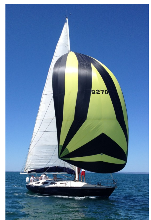
Imagine – winner on the day -again.