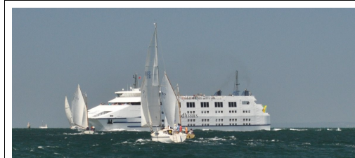
Ferry-baiting off Queenscliff