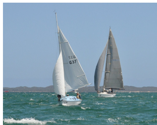
Sundance overhauls a reefed Tintagel.

Another modification was to stagger the starts at 5 minute intervals to reduce the panic on the starting line.