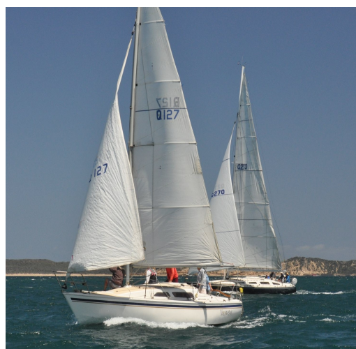
Imagine overtakes Valentine

Over the line the order was: Sundance, Imagine, Drizabone, Maud, Warrior (but not 'competing'), Valentine, Tiercel, Boomaroo, and Tintagel – though the staggered start and the occasional anomaly distorts any comparative value in this order. With Imagine's spinnaker confined to its bag and Sundance just off the slip, their handicaps put Sundance first and Imagine last, the remainder of the order being Valentine second, followed by (Warrior), Tiercel, Maud, Drizabone, Tintagel, and Boomaroo.