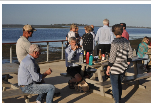
Fine evening for a BBQ