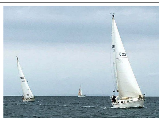
Boomaroo passes Tiercel

not by corrected times nor by order at precisely 2 hours. Also the important addition of a radioed start signal for those of us who had not reached the starting area by 13.30. (Thankfully not interfered with by radio chatter from elsewhere).