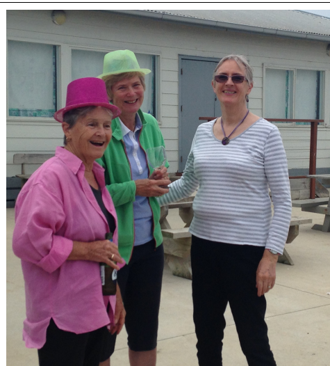
Merry colour co-ordination.