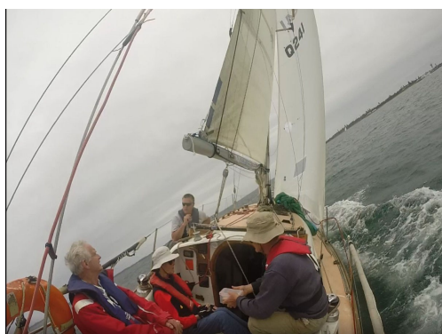
A brisk moment on Tiercel