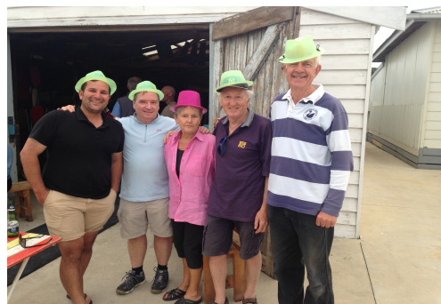
Winners are grinners Festive hats for Drizabone and OODs.

only drama was Valentine copping a sudden lull in the wind together with an eddy in the tide, resulting in the engine being needed at the cost of retirement. Other vessel-specific dramas included Tiercel attempting to jibe the asymmetric and getting a line under the boat and round the rudder – thankfully with rudder locked amidships not hard over which could