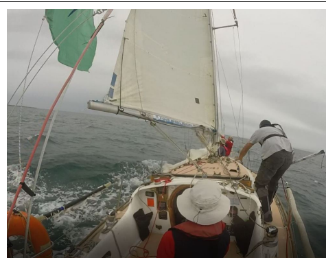
And kite going awol (airborne without leave)

have been spectacular. Sundance also had a spinnaker issue. The order across the line (hence placings) were Drizabone, Tintagel (almost tied), Boomaroo, Warrior, Imagine, Sundance, Tiercel, Rosie, with Valentine retired. The handicapper was relieved to see Imagine catching up with Sundance close to the finish time, and indeed even closer was the convergence between Sundance and Tiercel. RaceQs showed that