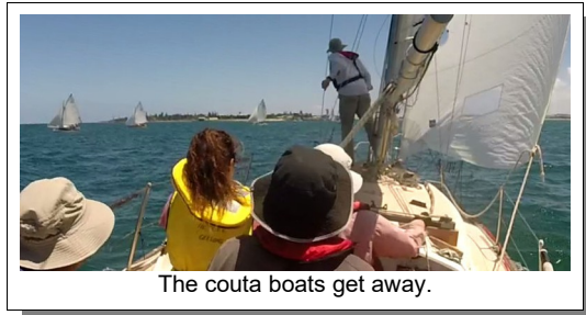
The couta boats get away.

Another beautiful day on the water for the Commodore's Cup. The forecast of (yet another) southerly, this time about 15 knots, was fulfilled and the predicted flood tide was at least if not more than matched by reality. Great to see some newcomers fitted into boats and on the water as that's what it's all about.