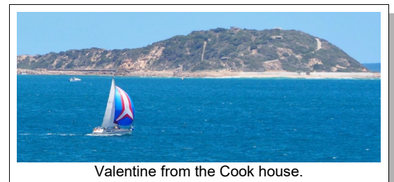
Valentine from the Cook house.