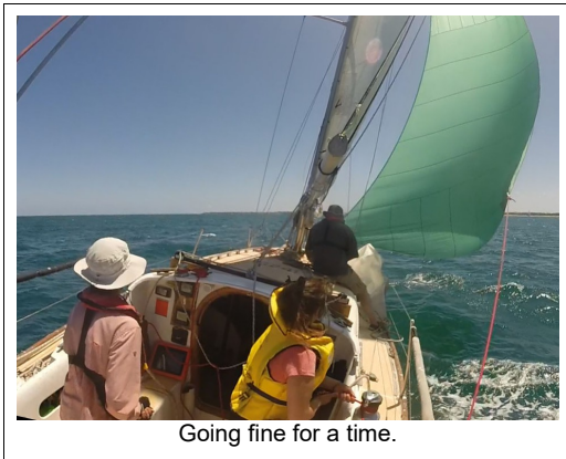
Going fine for a time.

A "one-off" course was decided upon, being Grass Beds to Popes Eye pile, Parks inner, Parks outer, inner, outer, QA and GB finish. No great dramas known to the writer, except his own glitch of blooper again going Airborne Without Leave just as avoiding a large container ship.