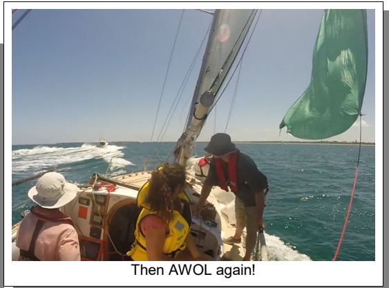
Then AWOL again!