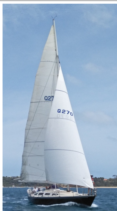
Imagine from Boomaroo.

It was a hard day on the water for the Couta boats, with plenty of muscle-work, and even some larger boats (unless reefed, as was Imagine as far as Sorrento) provided hard work for the crews. The wind was steady in direction (South at South Channel Fort) but was, not surprisingly, lighter and more flukey in the region of Sorrento and Portsea. Valentine got her spinnaker up just before the Portsea Hole buoys and held it when back in the brisker winds offshore. Tiercel, well behind saw occasional 'flutterings' and opted for caution in goose-winging the jib. Unfortunately trying to be clever lost the whisker pole overboard and consequently lost minutes in retrieving it.