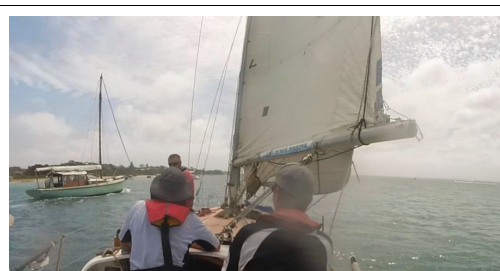
Handsome motor sailer exiting Sorrento..

Another race for the die-hards, with the exception of Sundance still propeller-less. A brisk day, with forecast wind in the upper teens, and the knowledgeable locals suggesting more. Eight vessels signed on at briefing, with a bit of crew-juggling to get them all on the water. Sadly, gear failure took out Drizabone and Maud before the start.