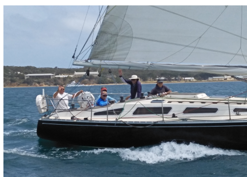
Imagine finally passes Boomaroo (Portsea Quarantine Station in background)

The remainder (Rosie, Warrior, Tiercel, Boomaroo, Imagine and Valentine) set off in brisk conditions, with gusts often over 20 knots, on the special course of: start near QA, Popes Eye beacon, Sorrento #1, Porsea Hole, and Grass Beds finish. Cameras largely stayed in bags owing to the conditions, but thanks Alison for these photos of Imagine.