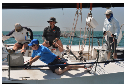
Concentration on Sundance.