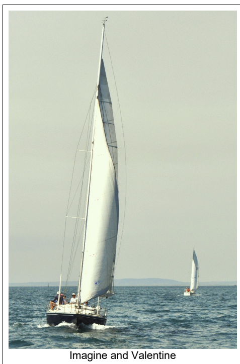
Imagine and Valentine

boats was offset by Div 2 staying further out of the tide. That is until Swan Spit forced everyone to crab across the fierce stream with a safe margin uptide of the dreaded pile.