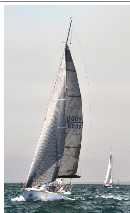
Sundance and Imagine