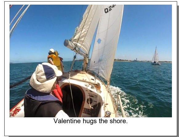
Valentine hugs the shore.

With a cleaner hull, Tiercel held off Valentine with both looking for the inshore territory. Boomaroo was going fast but found more tide offshore. Imagine and Sundance got away and, as usual, overhauled the rest of the fleet, but this time Sundance had the edge for speed.