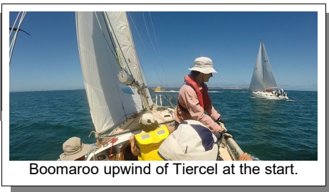
Boomaroo upwind of Tiercel at the start.