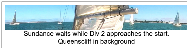
Sundance waits while Div 2 approaches the start. Queenscliff in background

On the water, Course 7 was announced, which in the event was shortened to Grass Beds, Popes Eye, Swan Spit Popes Eye and QA. Vessels got away promptly with only one late start (1 minute) being noted. However, the fierce tide got hold of Rosie's underwater growth and, unsurprising, culminated in a dnf as tacking against the tide proved too much .