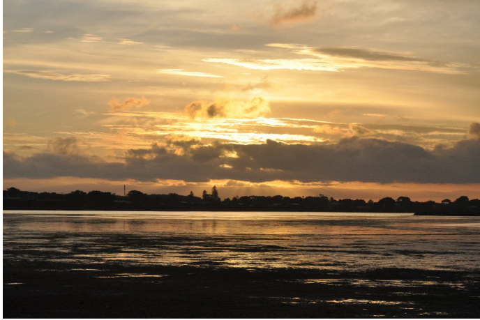
Sunset as enjoyed at the evening's barbeque..