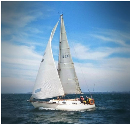
Tiercel – winner on the day.