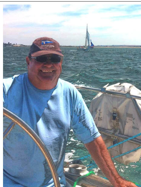
Portrait on Imagine (and a bit of spinnaker strife in the background (why Laker looks happy?).