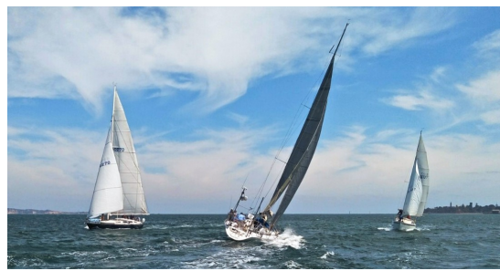
Imagine, Sundance and Valentine.