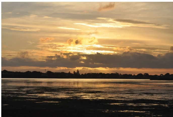
Sunset as enjoyed at the evening's barbeque..

and the last beat to the finish started that hope evaporated. Over the line the order was Imagine, Sundance, Boomaroo, Valentine, Tintagel and Tiercel. After Tiercel's miserable performance in the last race, dragging an an extensive marine ecosystem underneath, the combination of a partially cleaned hull and a fresh wind brought about handicap results of Tiercel, Valentine, Imagine, Sundance, Boomaroo and Tintagel.