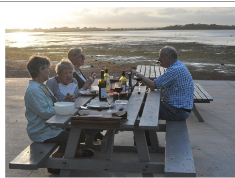
BBQ on the deck.

and the last beat to the finish started that hope evaporated. Over the line the order was Imagine, Sundance, Boomaroo, Valentine, Tintagel and Tiercel. After Tiercel's miserable performance in the last race, dragging an an extensive marine ecosystem underneath, the combination of a partially cleaned hull and a fresh wind brought about handicap results of Tiercel, Valentine, Imagine, Sundance, Boomaroo and Tintagel.