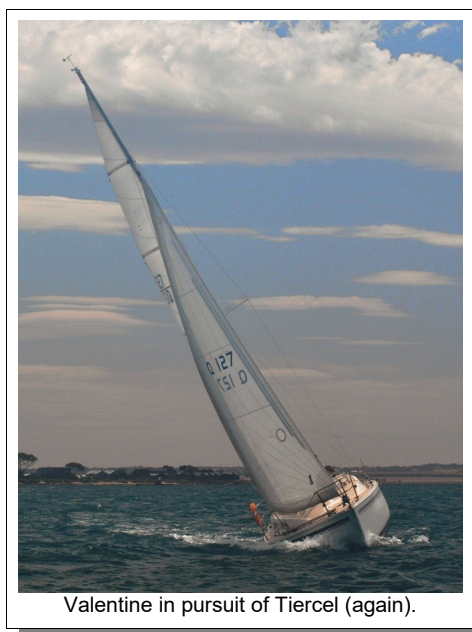
Valentine in pursuit of Tiercel (again).

Not only was the wind forecast off the mark in terms of strength but the wind was fickle which compounded the challenges of a strong ebb tide. Rosie found a hole right at the start line and struggled to cross despite brisk winds elsewhere. Then it was a lively circuit, starting near W#3 to W#4, QA and back to W#3, then heading back towards W#4. However, at that point Sundance found a big hole in the wind and stalled. Tiercel blithely followed her into it and stalled also. Others, including Valentine, Drizabone, Tintagel and Boomaroo headed off to the far east prompting bitter thoughts that “those beggars will steal a big march on us here” but they found their own hole in the wind and no less tide. At this point Rosie found her second big calm and retired in favour of a social commitment, thus saving her the drama of 30 knots later on.