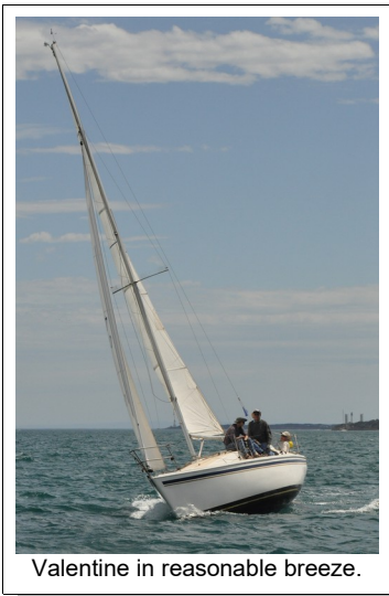
Valentine in reasonable breeze.

Another brisk leg between W4 and W3 and back to 4, when the wind really got up. At least there was room to manoeuvre when gusts around 30 knots caused uncontrollable rounding up - on the last reach to Grass Beds. Over the line (with relief all round) the order was Imagine, Sundance, Boomaroo, Tiercel, Valentine, Tintagel and Drizabone.