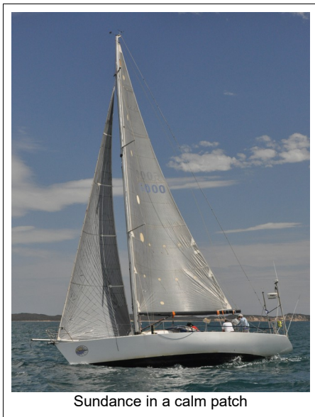
Sundance in a calm patch