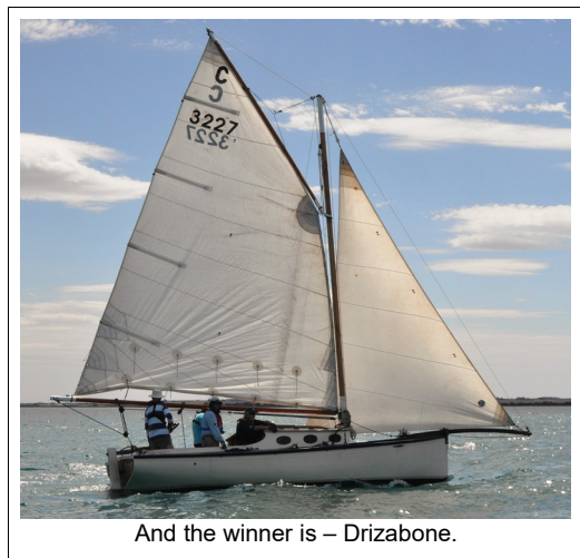
And the winner is – Drizabone.

A day with variety, but not one for the faint-hearted. Congratulations not only to the winner – Drizabone – but to all who competed. One could also congratulate, for their good sense, those who withdrew.