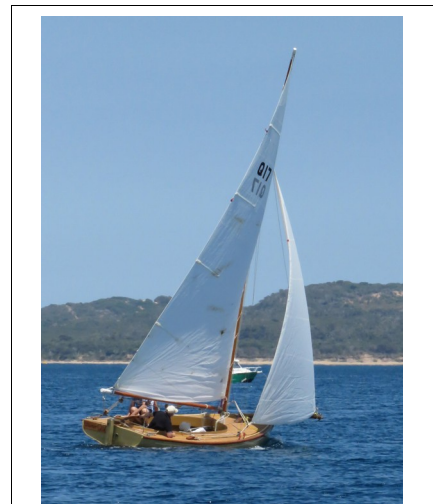
Welcome return for Warrior

Despite that, Imagine followed Warrior close inshore, minimising tide, indeed the first part of the race probably hung on decisions about “shortest distance or minimise tide”. Tiercel taking