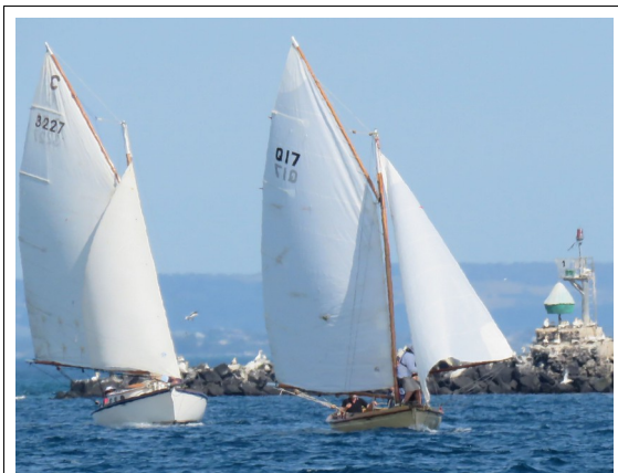
Some serious work to hold off Drizabone

7 Vessels signed on and off to battle. Course 6 was announced. Div 1 vessels had a more crowded start than of late but incident-free. Div 2 also away without incident, with Tiercel giving plenty of room to Valentine with no hope of crossing the line on starboard tack, but both tacking onto port on the 'gun'. Imagine in Div 3 had no competitors fighting for space or right of way, but instead managed to compete with the sea bed, which won for a time.