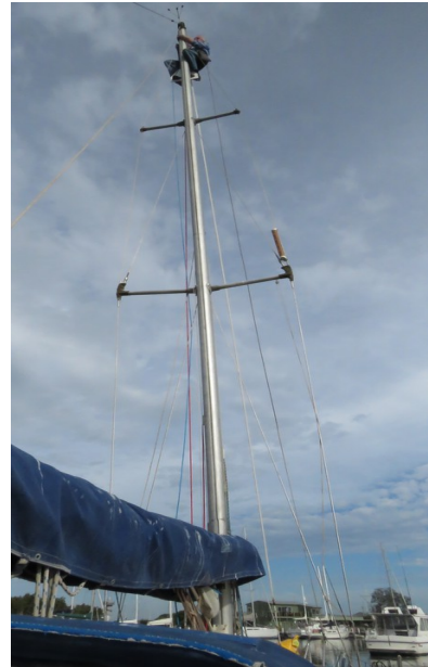
Price of racing when maintainance needed.