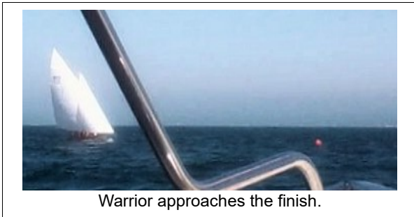
Warrior approaches the finish.

Tiercel, maintaining the blooper outside the jib, held off Sundance on the way to No. 3 with Imagine only just getting ahead. However, round the mark and heading for Drapers, Sundance became supercharged and rocketed ahead of Tiercel, while Warrior made the best of beating the tide. Imagine, then Sundance rounded Drapers and raised spinnakers, well ahead of Tiercel and Warrior, and Tiercel got its kite up soon after its rounding. By now the deck was cluttered with jib, blooper and miscellaneous lines. The race progressed with no overtaking, round Grass Beds and No. 3 but on the reach back to GB, Warrior was closing in on Tiercel. A shorten course flag at that point, about 4 p.m. saved Tiercel from being overtaken by Warrior, who would undoubtedly have won on handicap had the race continued to full distance (under lights??).