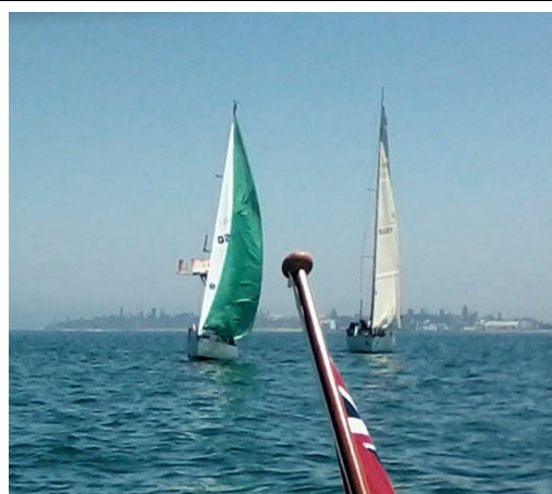
Tiercel & Sundance creep over the line.