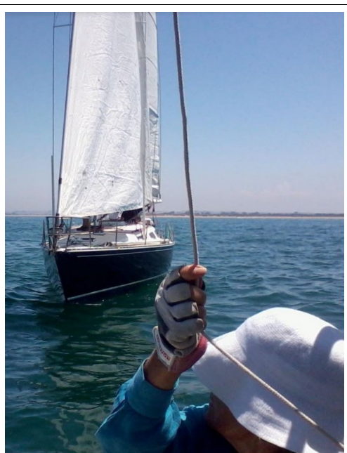
Imagine slides down-tide of Swan to start.

Briefing was brief, including mention of post-race drinks in the boatshed, and all proceeded to their vessels in increasing warmth and little breeze. First challenge was to negotiate the "Public Holiday" crowd of motor boats and jet-skis to exit the Cut with a fierce ebb tide.