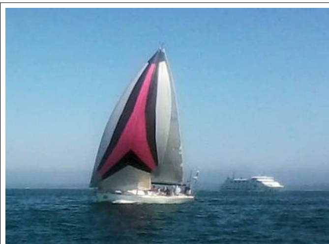
Sundance gets moving.

On the course, Swan displayed an innovative course (draft new course 7) involving QA (start), West Channel no. 3, Drapers, Grass Beds, No3, GB, No.3, Drapers, GB (fin). In Division 1 Warrior made a brilliant start in crossing the line from the uptide end in near-zero wind. Tiercel intended the same tactic but with tide overcoming wind did not even get uptide of the line, but crossed it and drifted down below QA to become stalled trying to get back to the line. In desperation the blooper went up as Imagine and Sundance joined in the start, with Imagine being the vessel making way. Ultimately all got over the line, by which time Warrior had drifted down towards the Heads. Tiercel toyed with laying an anchor which only brought about a faint breeze so up came the anchor again and soon a decent breeze appeared with the anticipation that Div 3 boats would wipe out the slower ones with Warrior having gone backwards and Tiercel no-where, in their first 20 or 10 minutes.